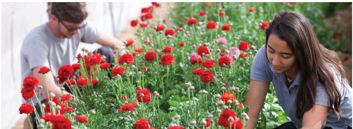
Workers at the Yair Agricultural R&D Center

Indulge in a farewell dinner before ending our journey at Ben Gurion airport to catch return flights back to the U.S.