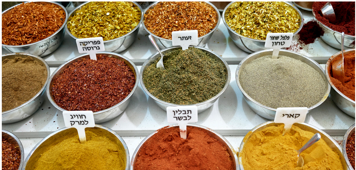
Colorful spices at Levinsky Market