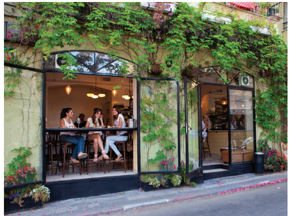
From left: the Tel Aviv Museum of Art, Tel Aviv's Neve Tzedek neighborhood