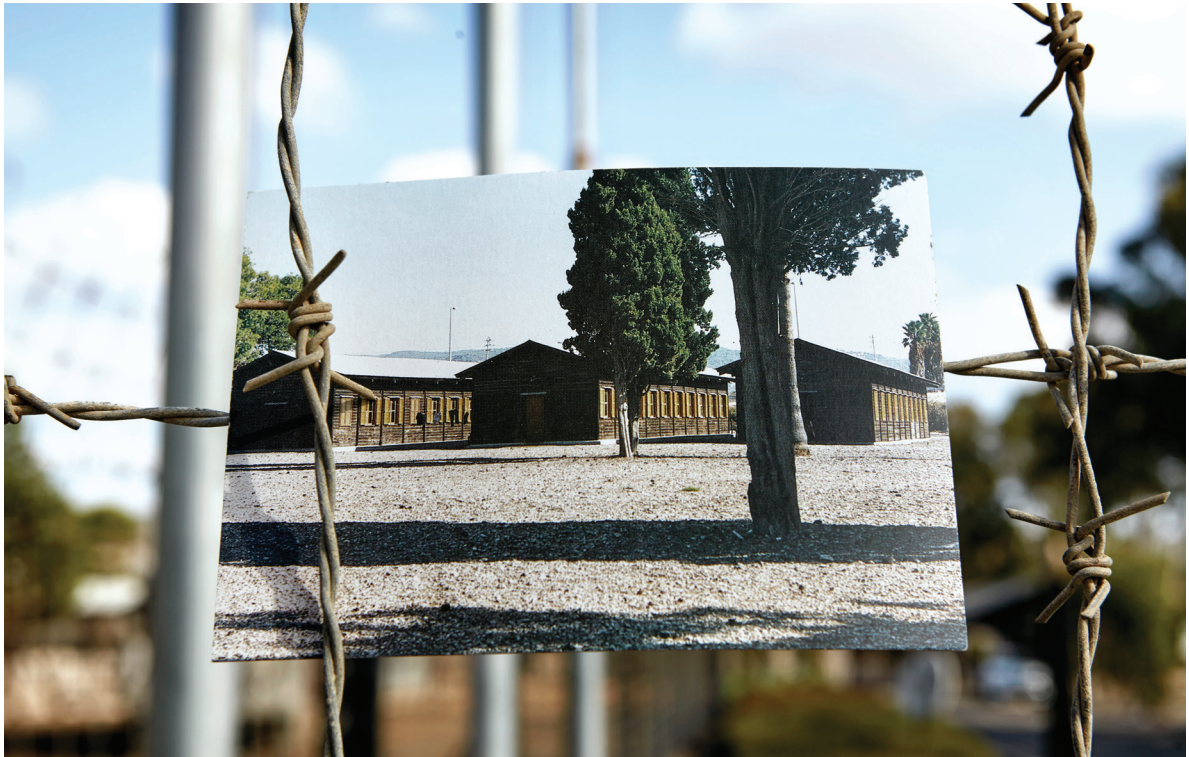
Barracks in Atlit Detention Camp

Tuesday, April 17 – Jerusalem (Erev Yom HaZikaron)