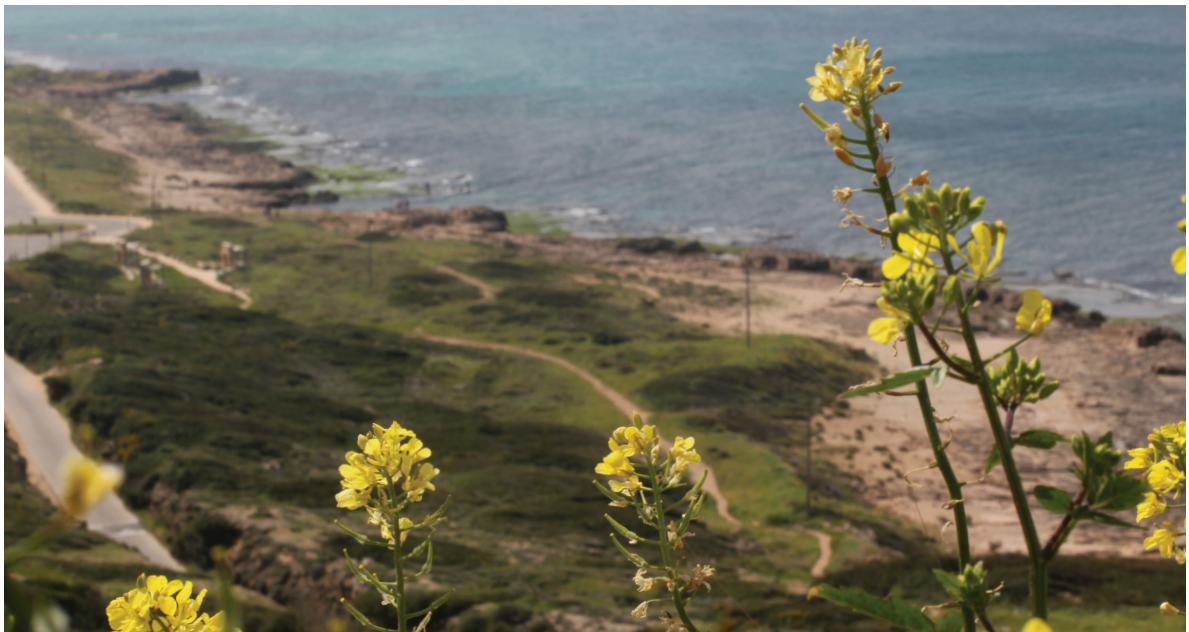
The Galilean coast

*Or similar hotel based on availability.