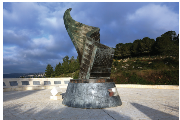
9/11 Living Memorial

Cramim Hotel, Kiryat Anavim (Jerusalem periphery)