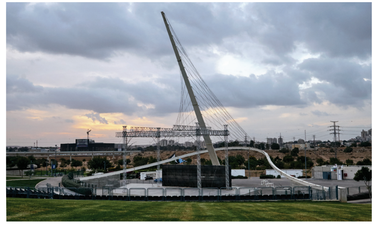
The amphitheater at Be'er Sheva River Park