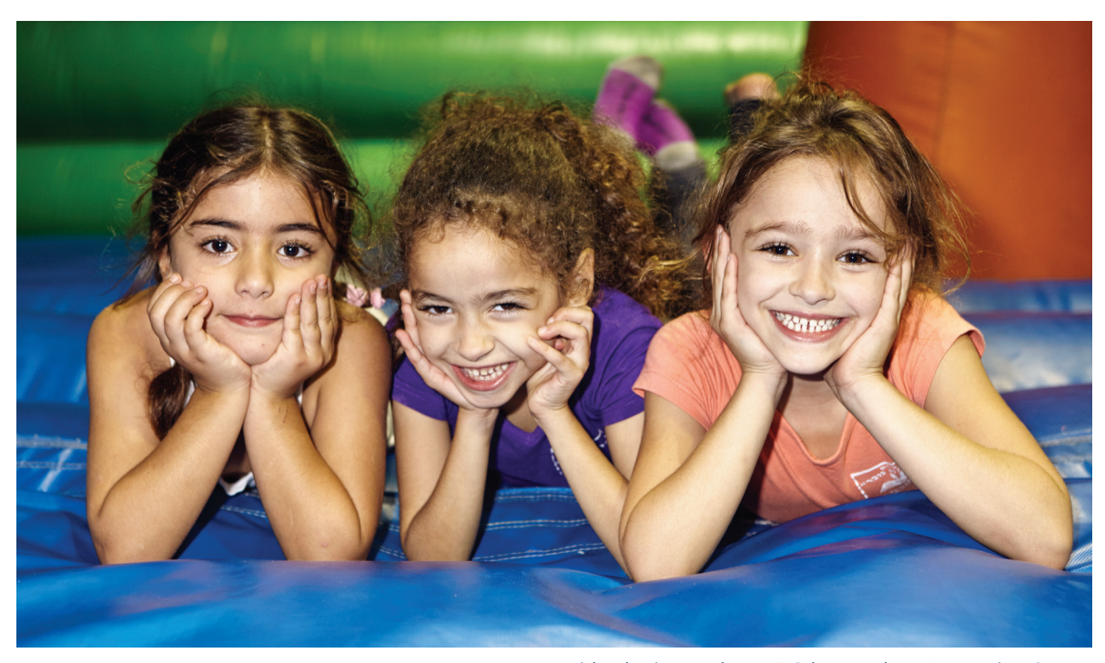
Kids playing at the JNF Sderot Indoor Recreation Center