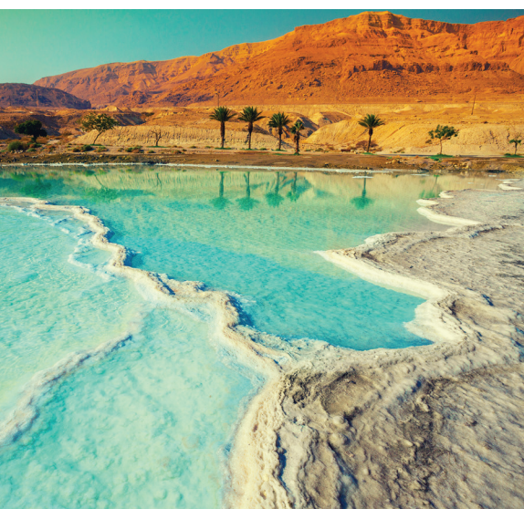
From left: Masada, Dead Sea