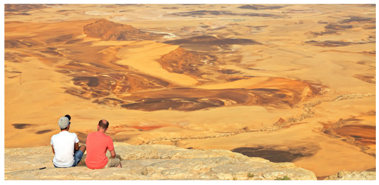
View of the Ramon Crater

*Additional cost - not included in tour price