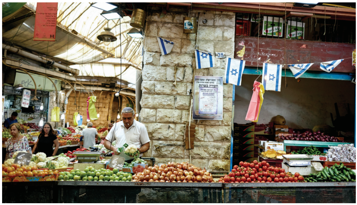
Mahane Yehuda Market