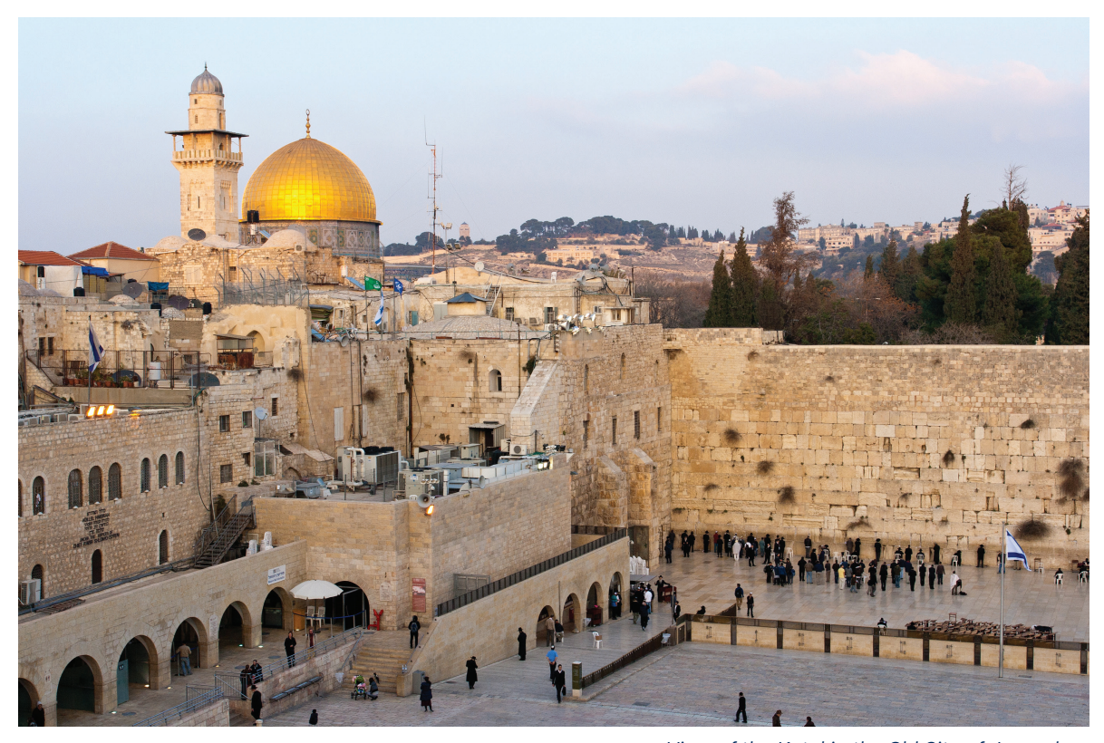
View of the Kotel in the Old City of Jerusalem

AM Today will be spent in honor of Shabbat . Services will be offered at the hotel for those who are interested or walk next door to the Great Synagogue.