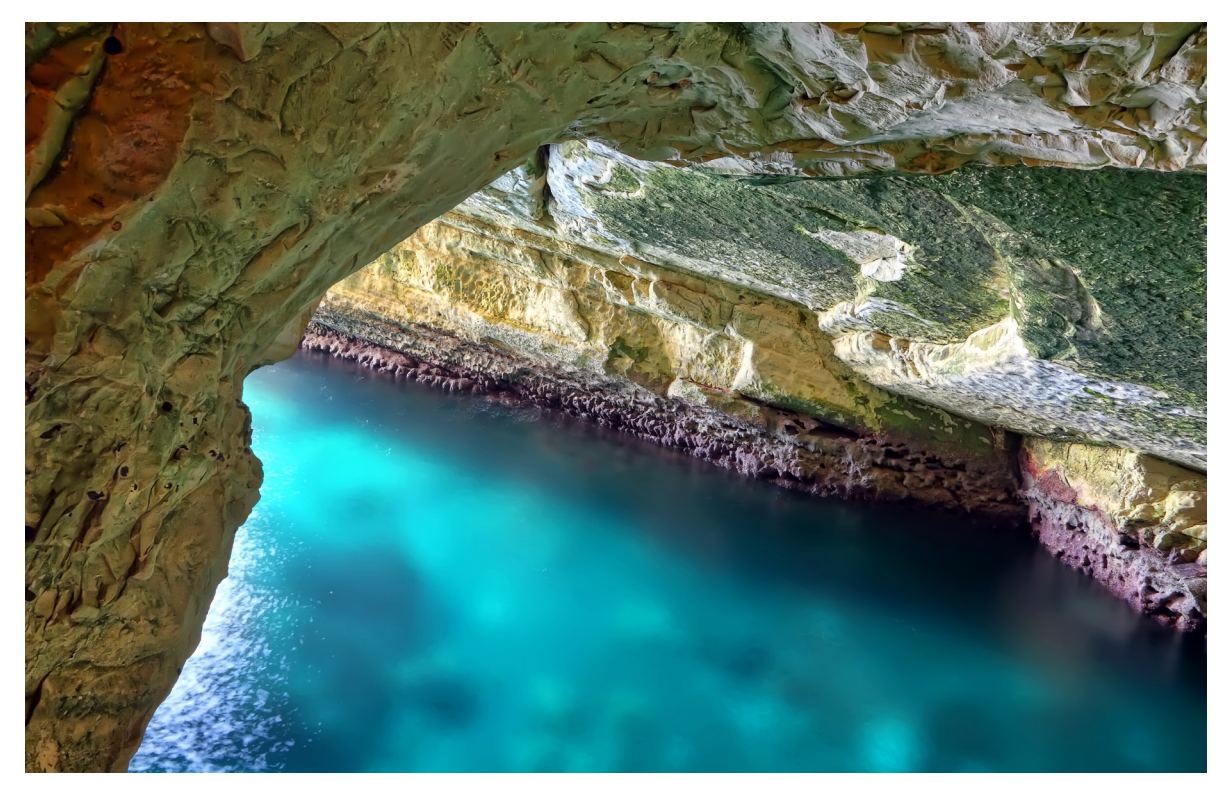
View of a grotto at Rosh HaNikra