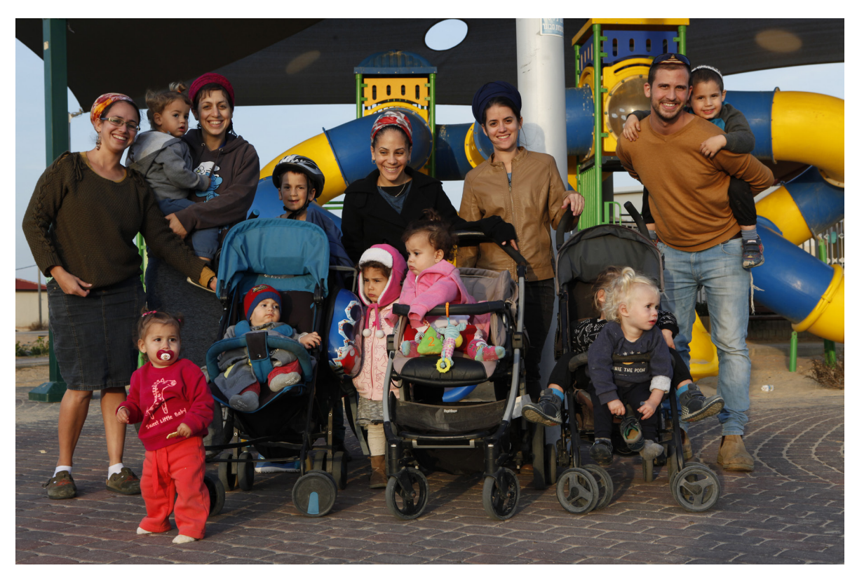
Families at the Jewish National Fund-Halutza Community Playground.