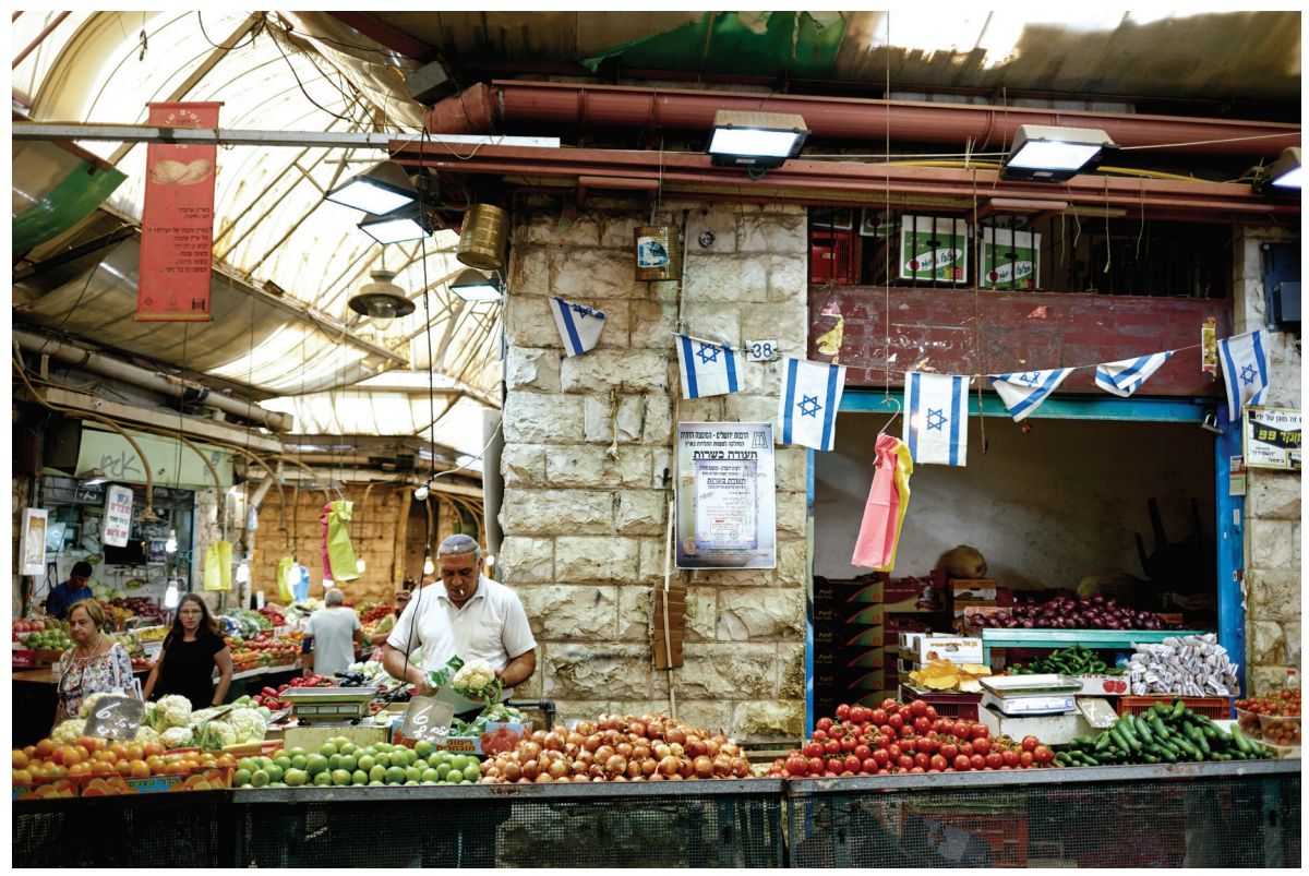
Mahane Yehuda Market