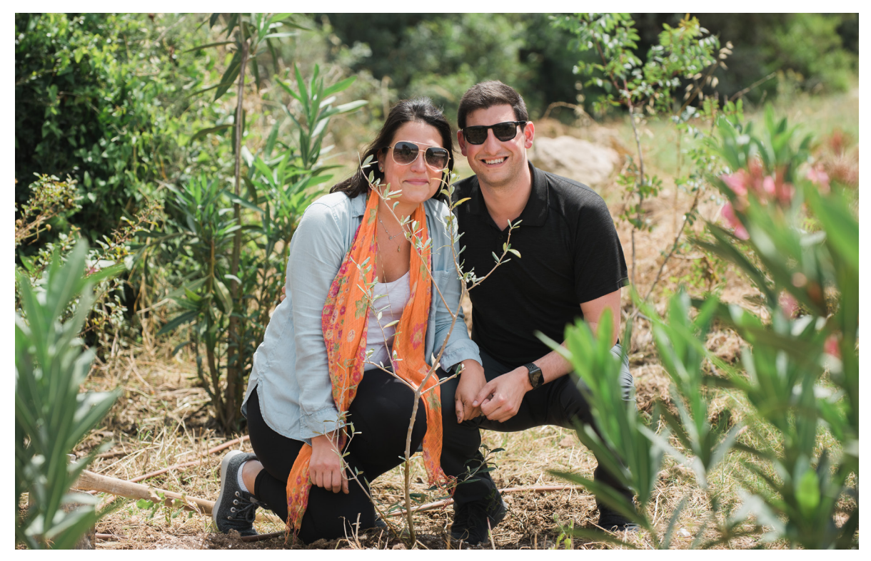
Planting trees at Neot Kedumim

Our journey concludes with a farewell dinner before transferring to Ben-Gurion Airport for return flights to the U.S.