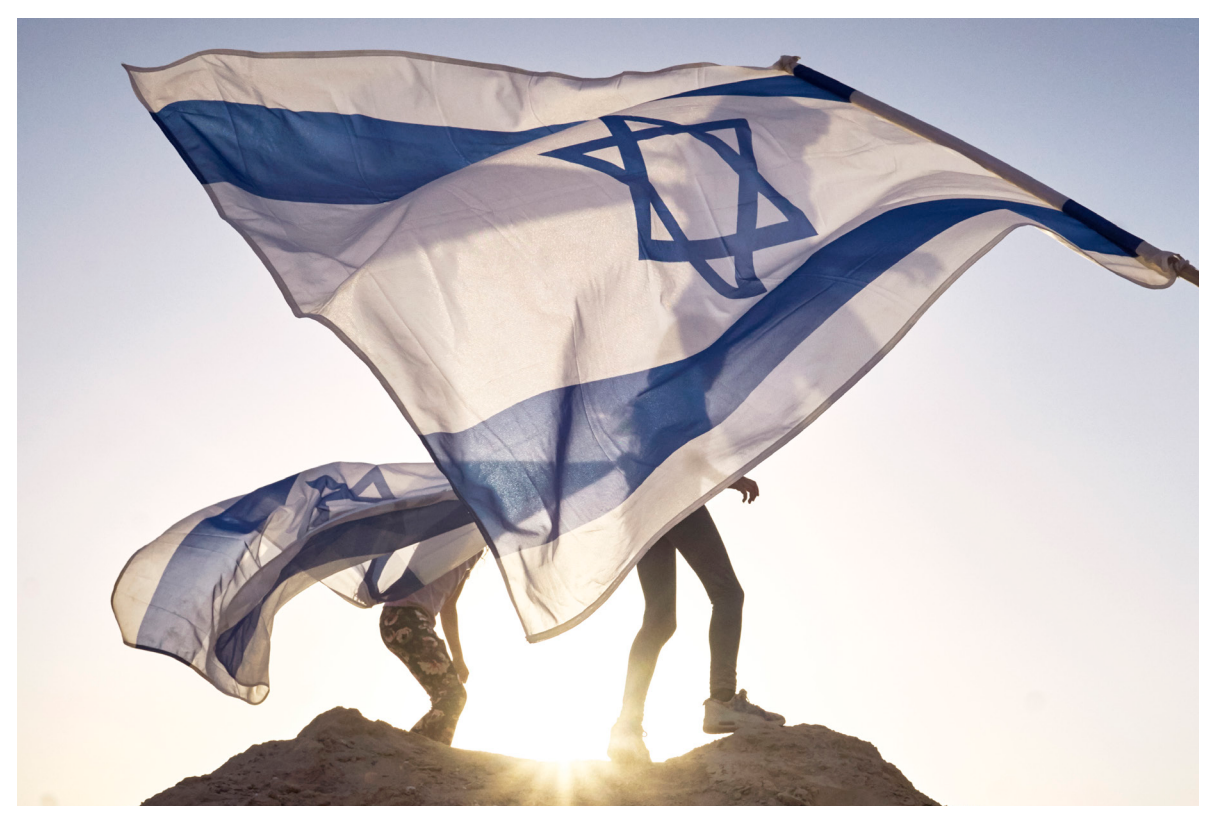
Welcome to Israel