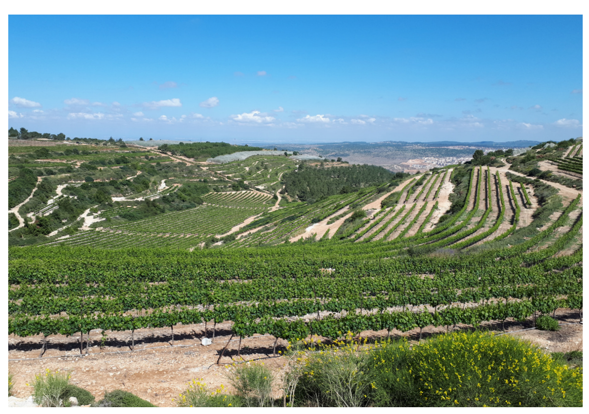
View of Gush Etzion from the Boys' Promenade