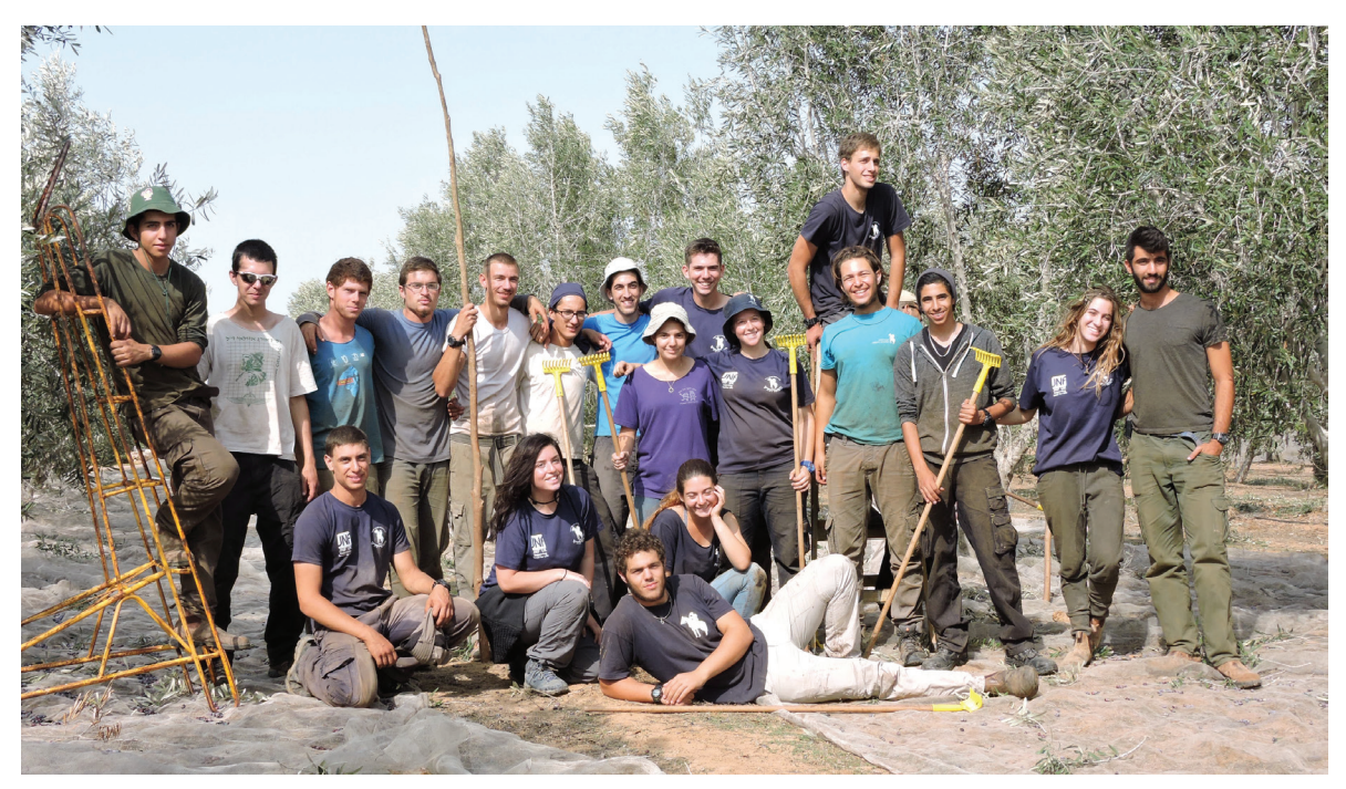
HaShomer HaChadash volunteers