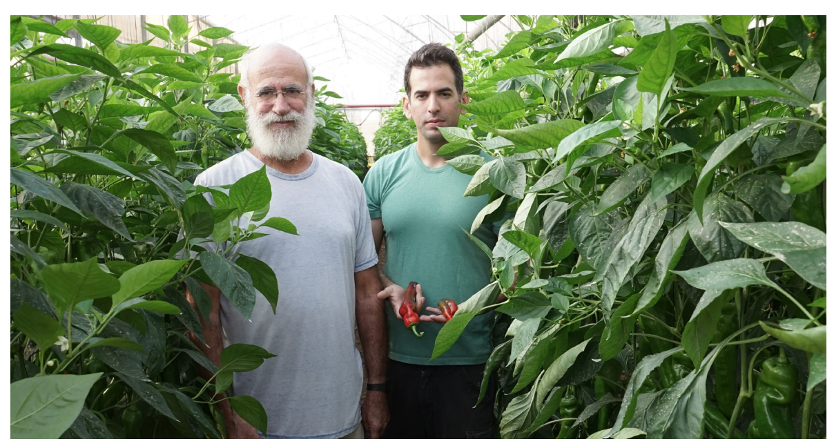
Central Arava Agricultural Center

AM This morning, travel to the Central Arava for a meeting with the Jewish National Fund representative and visit the state-of-the-art agricultural educational center.