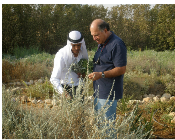
Project Wadi Attir