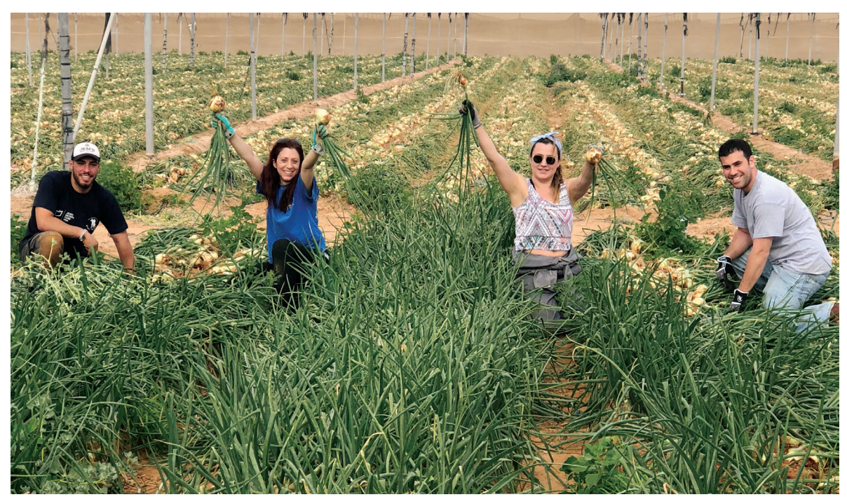
Volunteering in Halutza