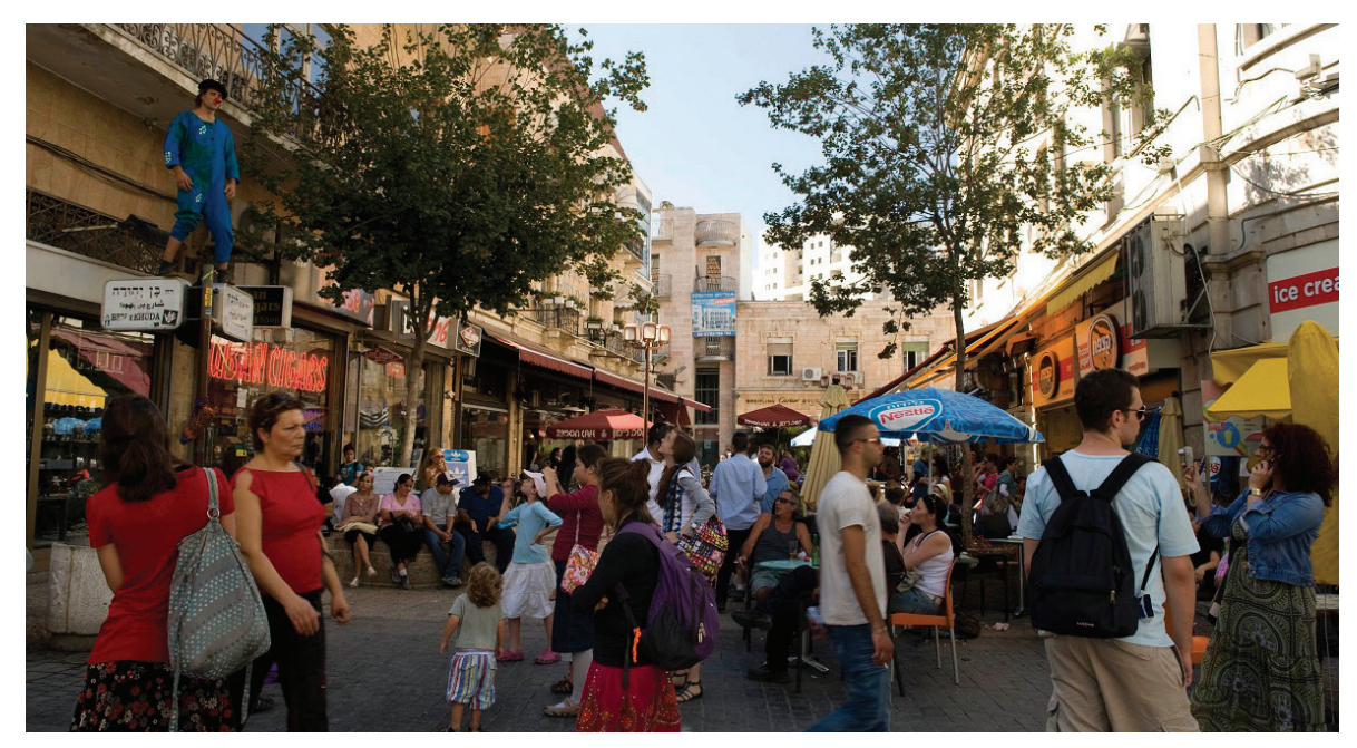
Ben Yehuda Street in Jerusalem

*Additional cost – not included in tour price.