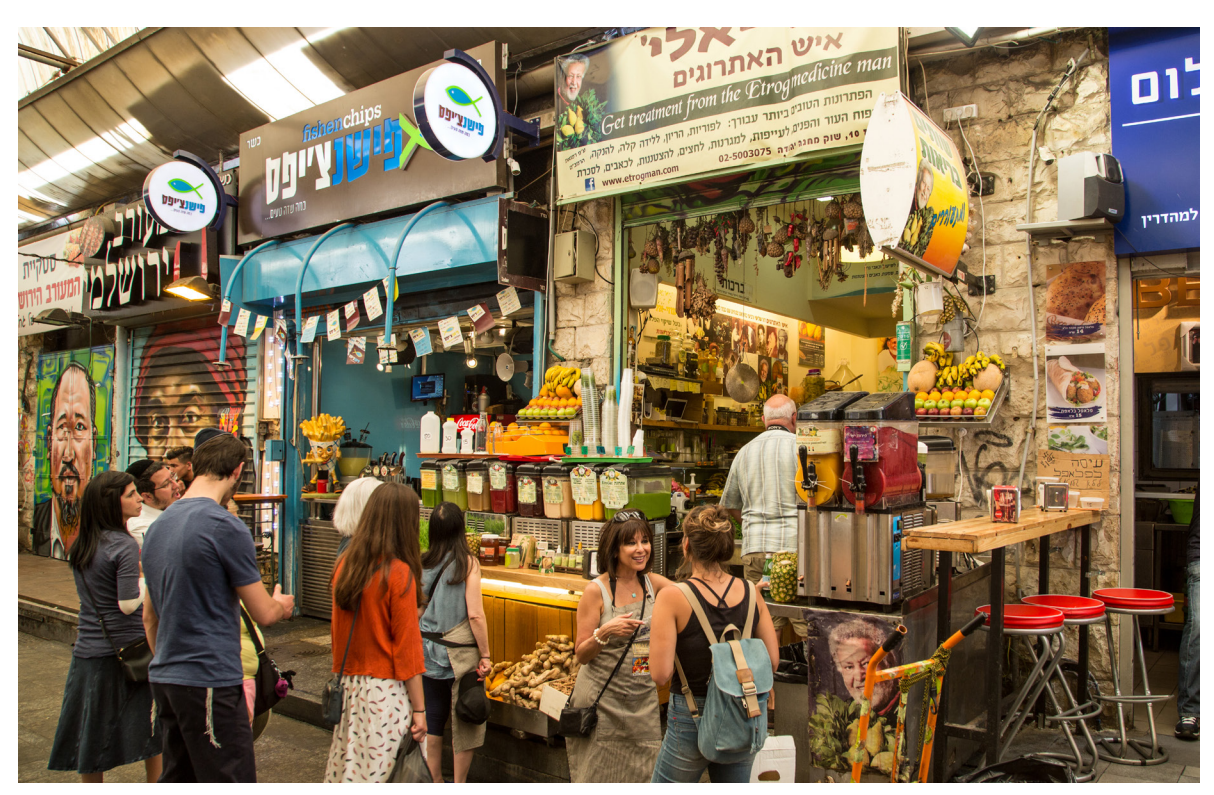
Jerusalem's Machane Yehuda Market