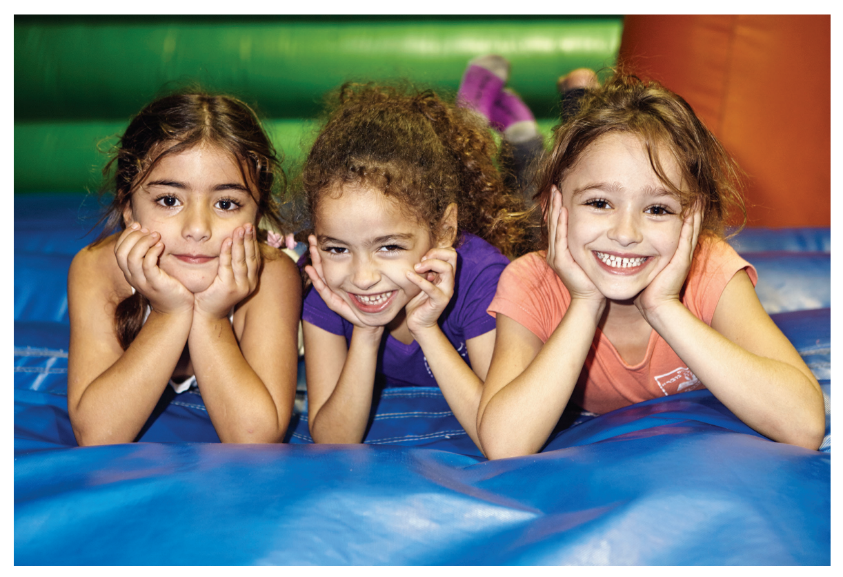
Kids playing at the Sderot Indoor Recreation Center

Enjoy a memorable farewell dinner before transferring to Ben Gurion Airport for return flights to the U.S .