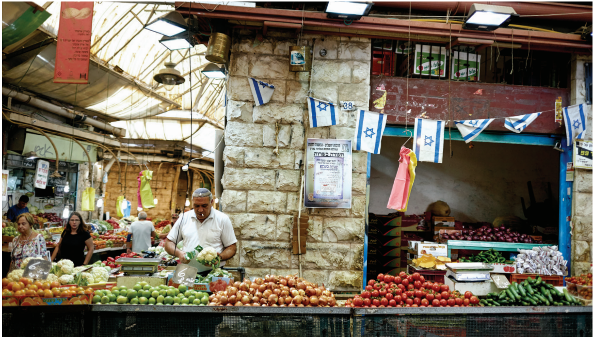
Machane Yehuda Market