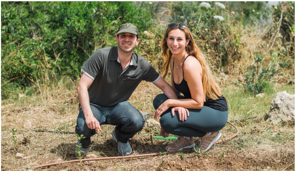
Harvey Hertz-JNF Ceremonial Tree Planting Center