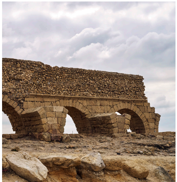
From left: Kishor Winery, Caesarea