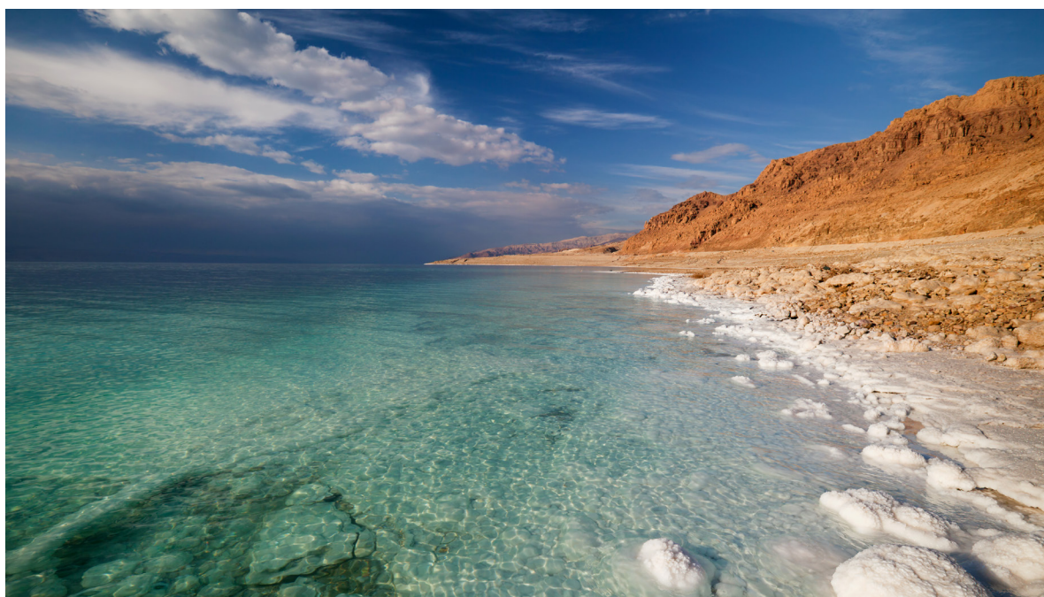
The Dead Sea

*Additional cost; Not included in tour price.