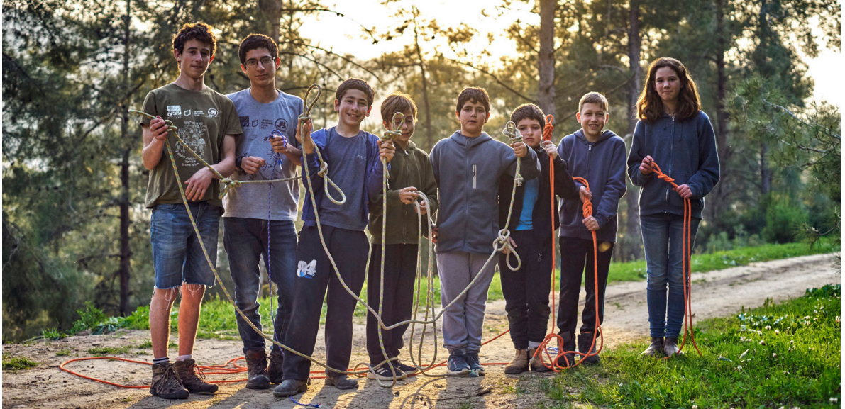
Youth from Green Horizons