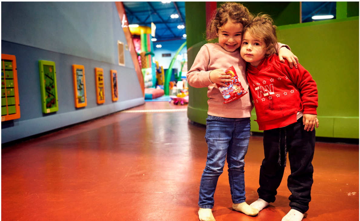
JNF Sderot Indoor Recreation Center

Enjoy a memorable farewell dinner before transferring to Ben Gurion Airport for return flights to the U.S.