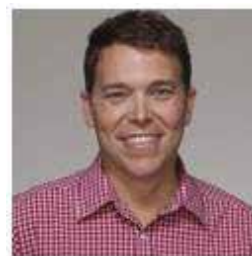
Bruce Feiler New York Times Columnist; Bestselling Author of Walking the Bible and Abraham