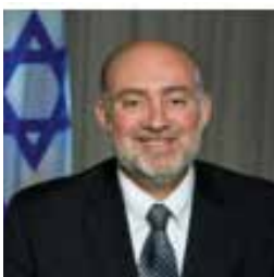
Ambassador Ron Prosor Permanent Representative of the State of Israel to the United Nations