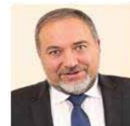
Avigdor Liberman Israel's Minister of Foreign Affairs