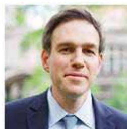
Bret Stephens Deputy Editorial Page Editor, Wall Street Journal