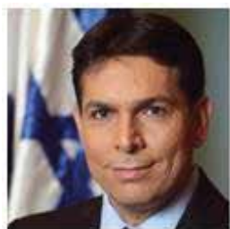
Danny Danon Israel's Ambassador to the United Nations