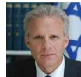
Michael Oren Former Israeli Ambassador to the United States