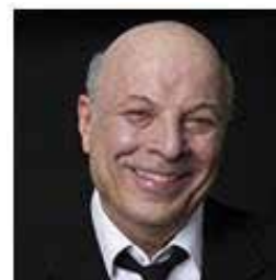
Charles Fox Grammy and Emmy Award Winning Hall of Fame Songwriter