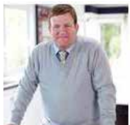
Dr. Frank I. Luntz President, Luntz Global LLC