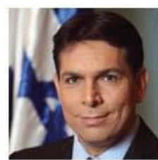
Danny Danon Israel's Ambassador to the United Nations