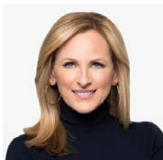
Marlee Matlin Academy Award- Winning Actress and New York Times Bestselling Author