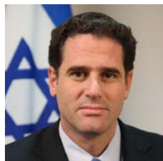
Ron Dermer Israel's Ambassador to the U.S.