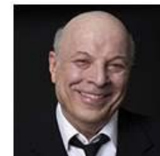
Charles Fox Grammy and Emmy Award Winning Hall of Fame Songwriter