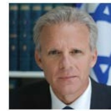
Michael Oren Former Israeli Ambassador to the United States