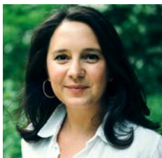
Bari Weiss Writer and Editor, New York Times Op-Ed Page