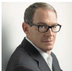
Daniel Silva Award-winning, #1 New York Times Bestselling Author