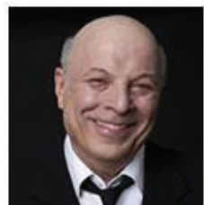
Charles Fox Grammy and Emmy Award Winning Hall of Fame Songwriter