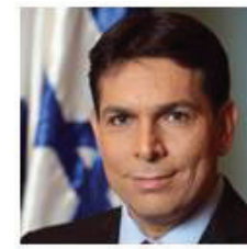
Danny Danon Former Israeli Ambassador to the United Nations