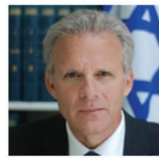
Michael Oren Former Israeli Ambassador to the United States