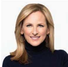
Marlee Matlin Academy Award-Winning Actress and New York Times Bestselling Author