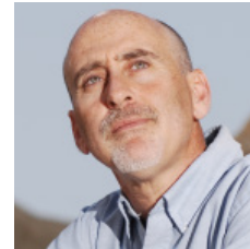
Alon Tal Founder of the Arava Institute for Environmental Studies, Member of Knesset