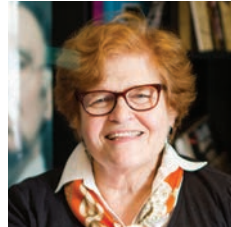
Dr. Deborah Lipstadt Dorot Professor of Holocaust Studies, Emory University