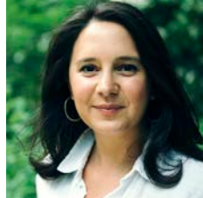
Bari Weiss Journalist & Author