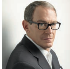
Daniel Silva Award-winning, #1 New York Times Bestselling Author