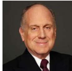
Ronald Lauder Chairperson of the Board, Emeritus JNF-USA