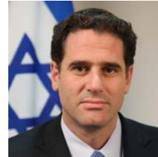
Ron Dermer Former Israeli Ambassador to the U.S.