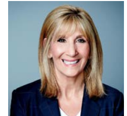
Jamie Gangel CNN Special Correspondent